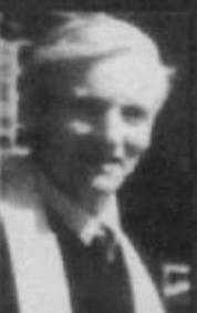
CALVARY PRESBYTERIAN CHURCH